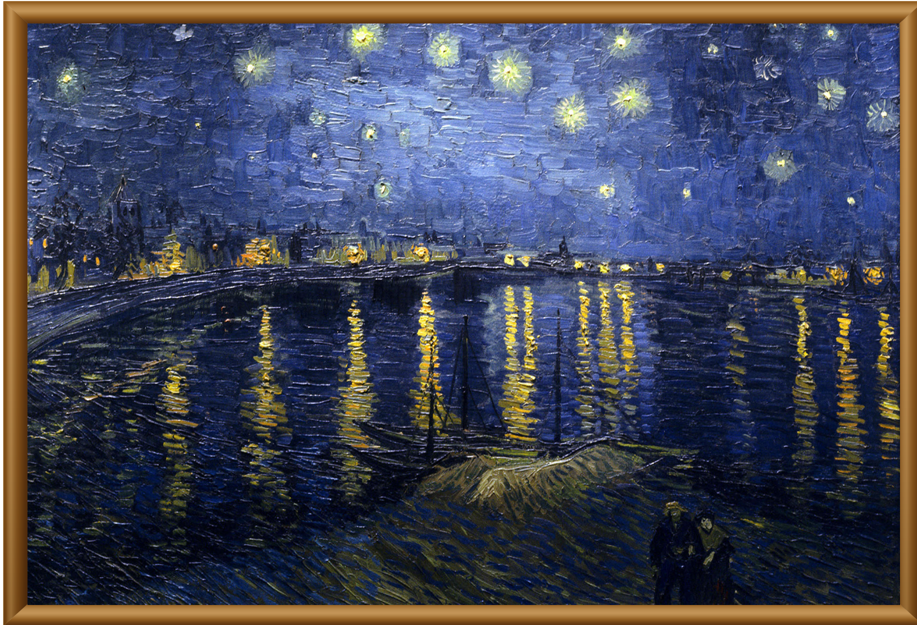
Starry night over the Rhône, 1888