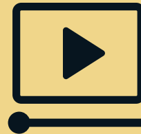
a short film