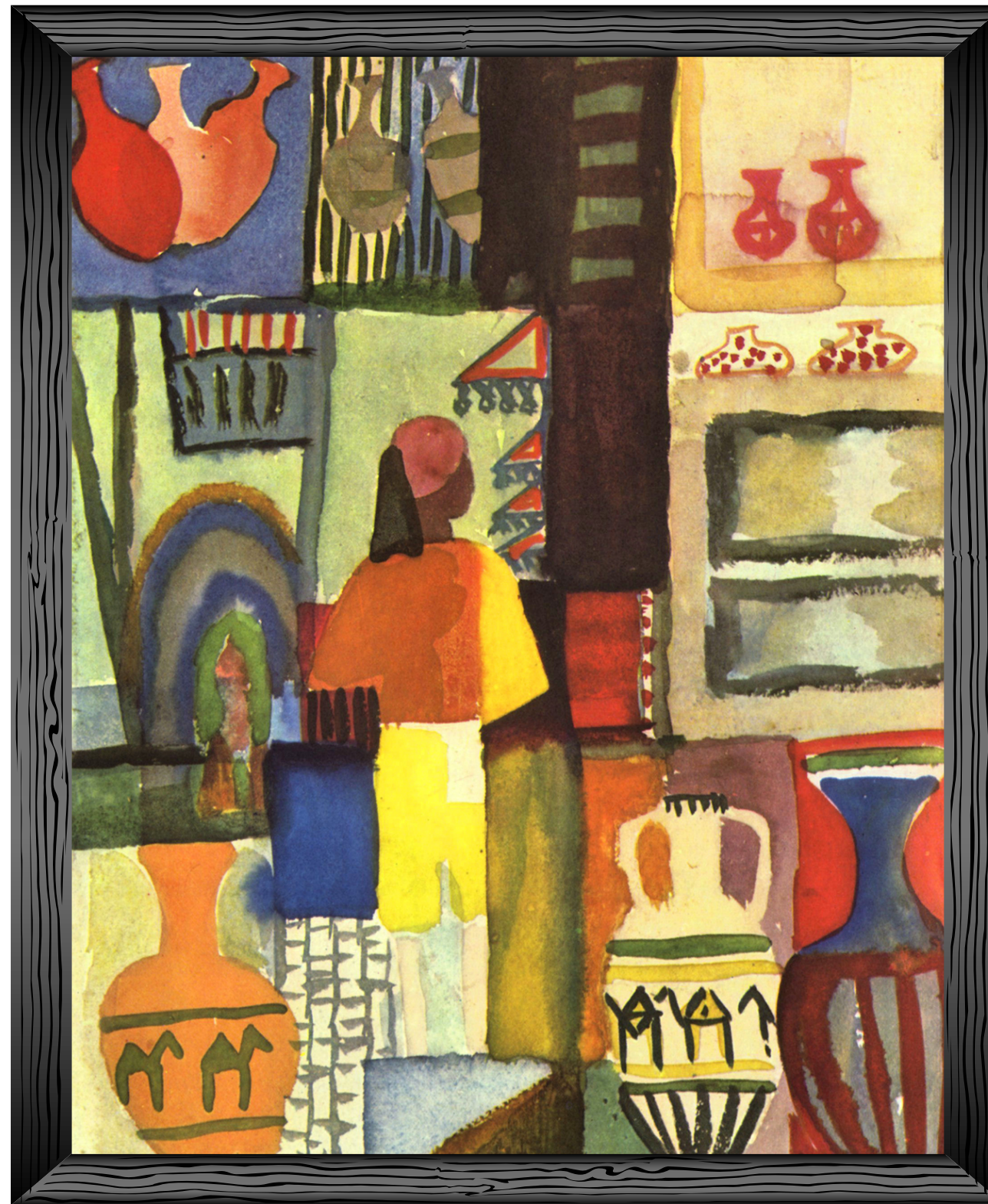
Tunisian Market, (also known as Dealer With Jugs, Traders with Pitchers.)