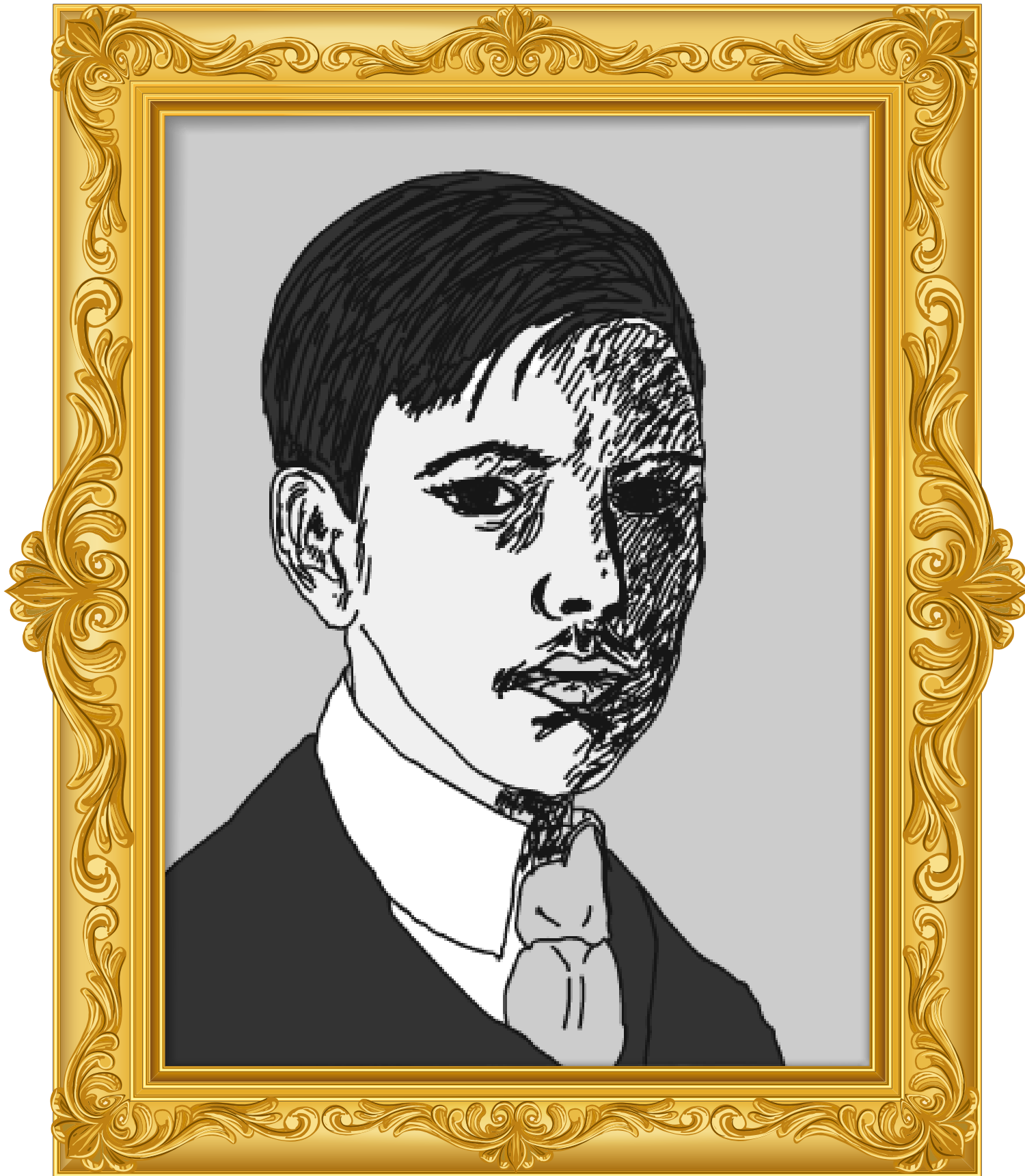
A sketch of August Macke's 1906 self portrait.

Unfortunately, Macke's life was cut short- he died on a WWI battle field in France at the age of 27.