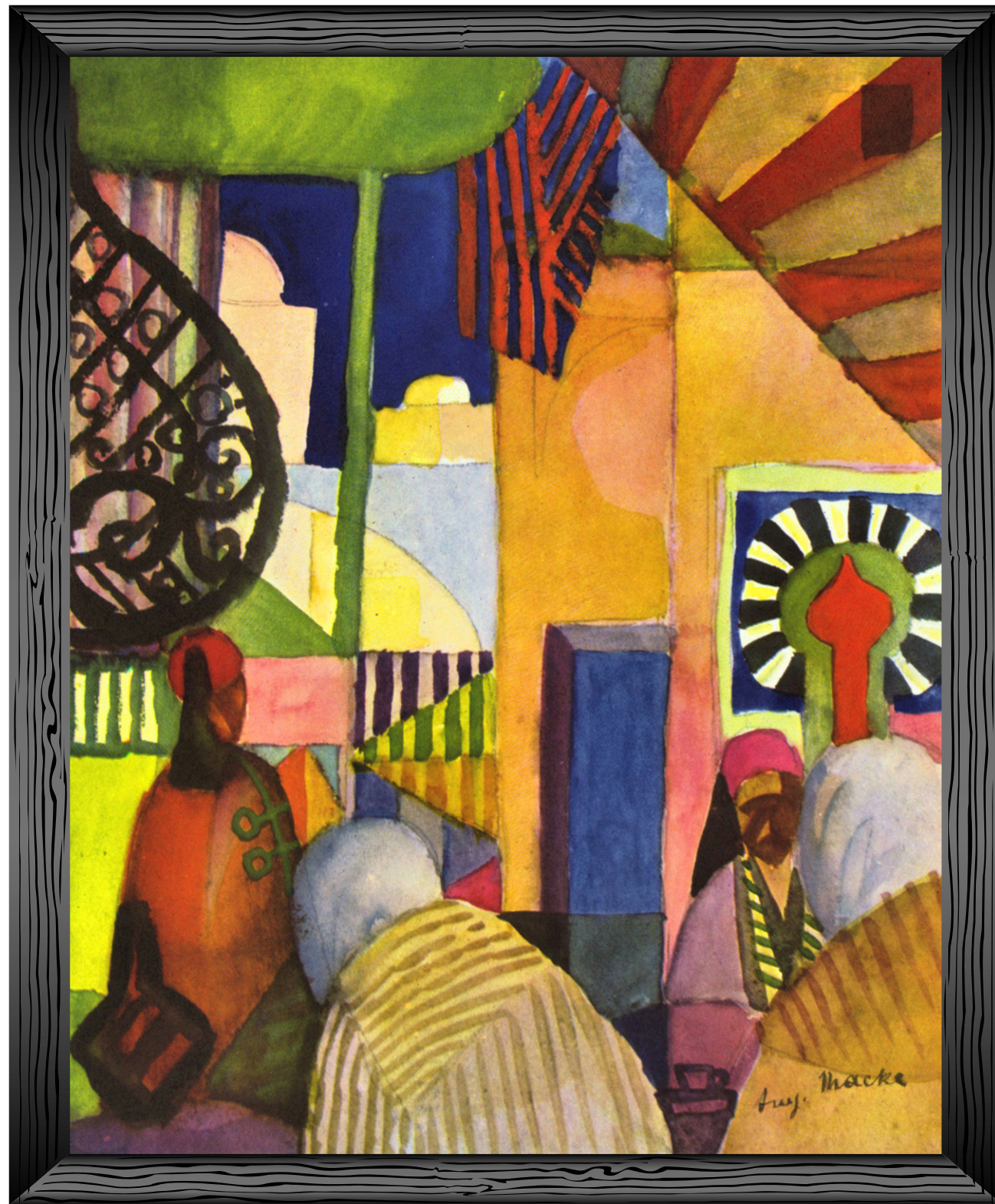
At The Bazaar