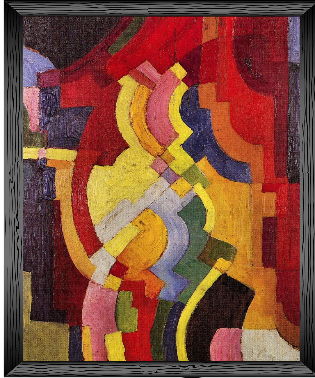
Coloured Forms III