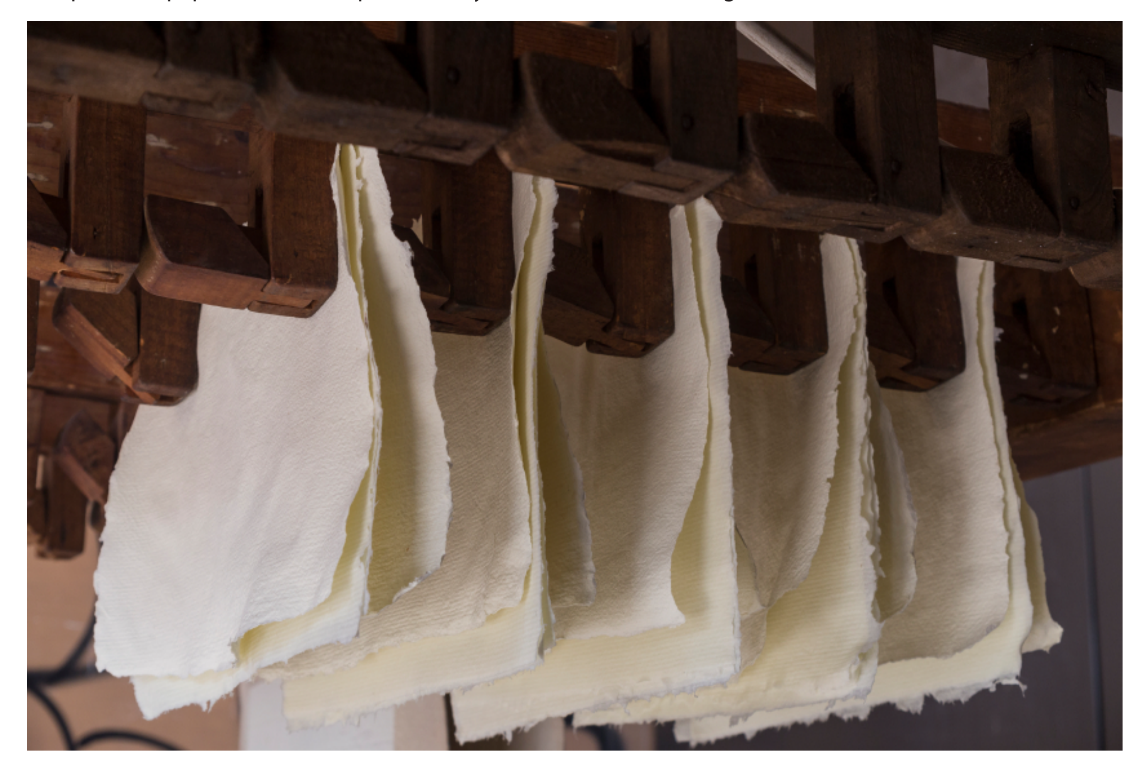
The pieces of paper can then be peeled away from their cloth backings and air dried.