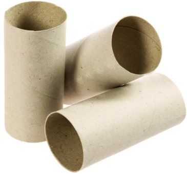
cardboard cylinders (from toilet rolls)