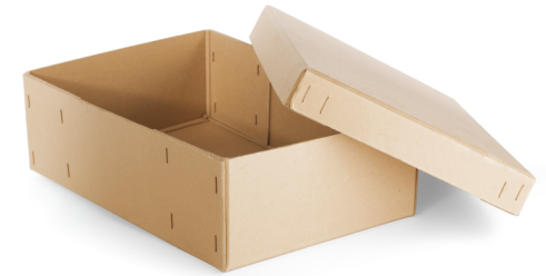
a recycled box (something to act as a tray)