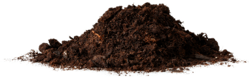
some potting mix