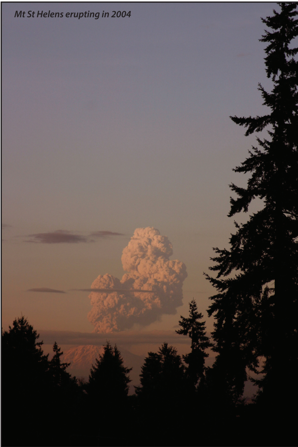
Mt St Helens erupting in 2004