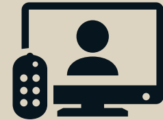
a slide show presentation