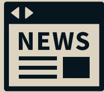
a newspaper article