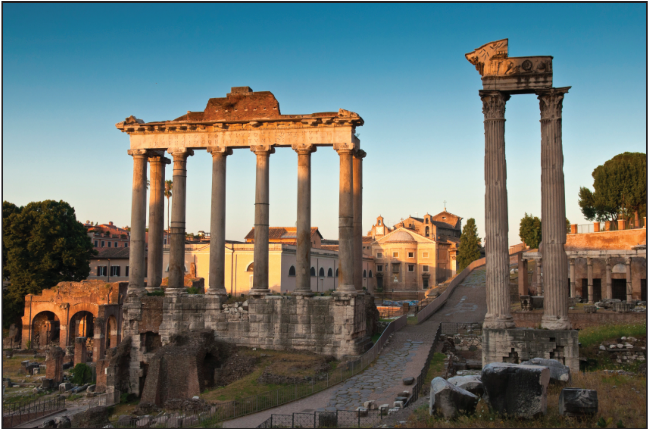
Roman Forum, Rome, ITALY