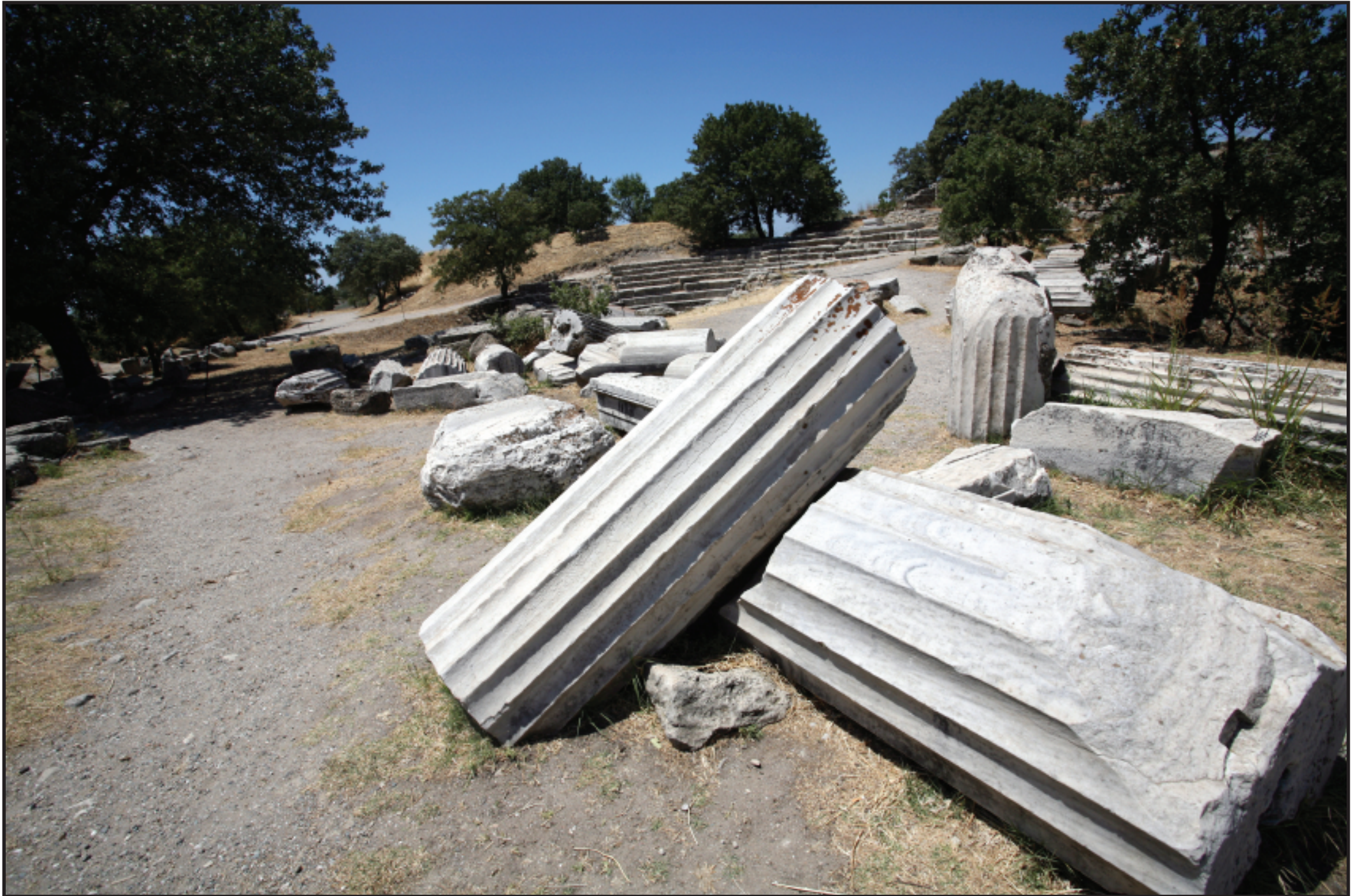
Ancient City of Troy, Çanakkale Province, TURKEY