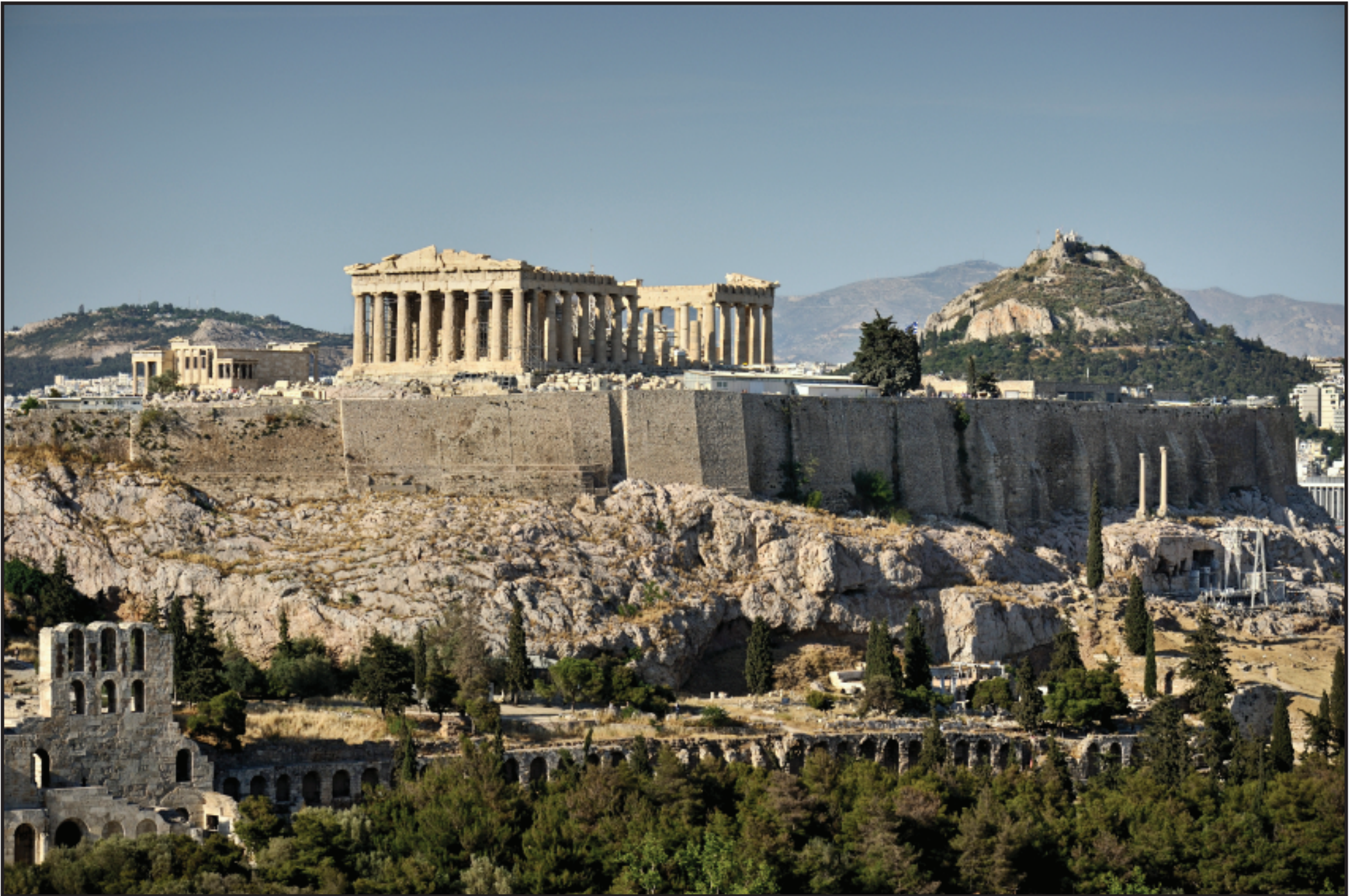
The Acropolis, Athens, GREECE