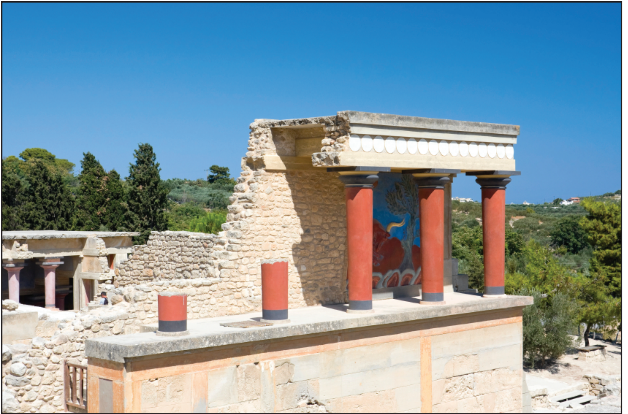
Knossos, Crete, GREECE