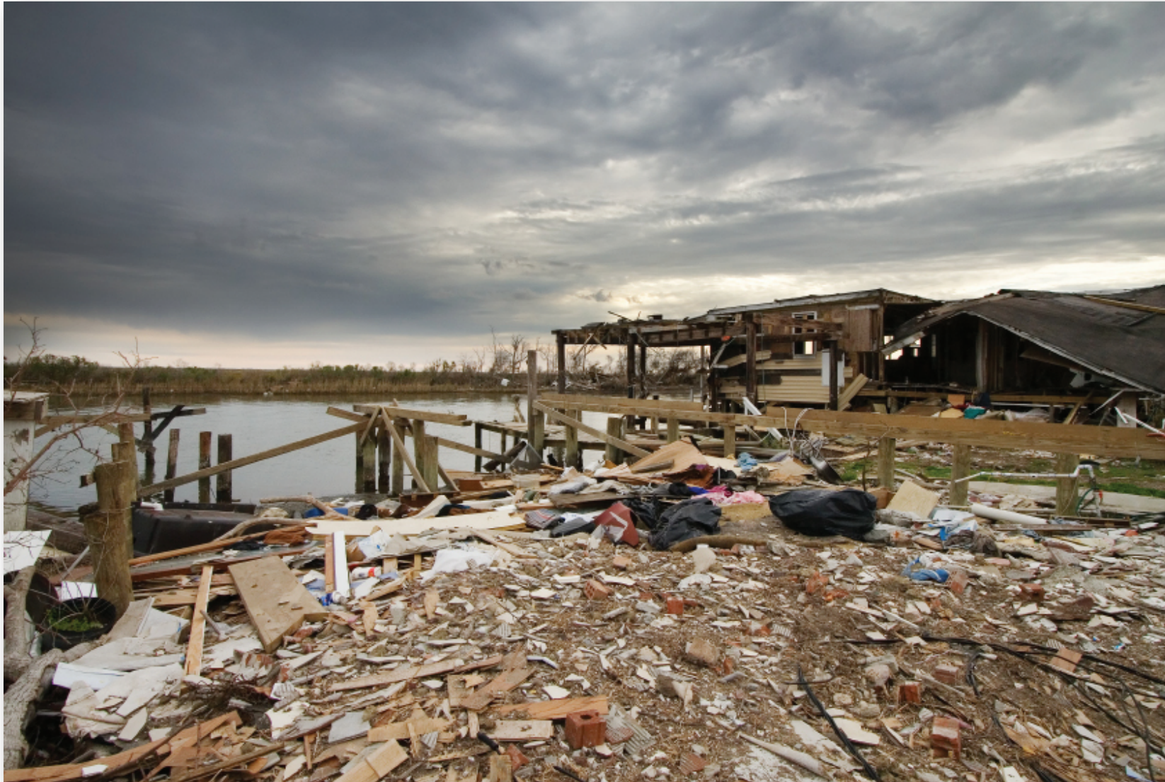
Destruction after Hurricane Katrina hit the Gulf Coast of the USA on August 29th 2005.

Extreme weather events have a great effect on human society.