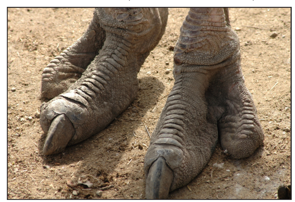
Feet of an ostrich, a current day flightless bird.