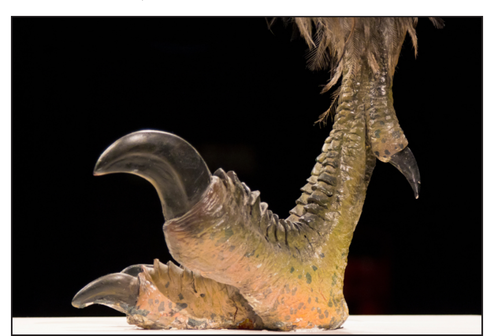
A scientific reconstruction of the foot of a velociraptor

Fossilised velociraptor specimens have been found in Mongolia. They are thought to have lived in the Later Cretaceous Period about 75-71 million years ago.