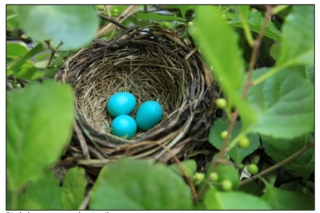
Birds lay eggs, so do reptiles.