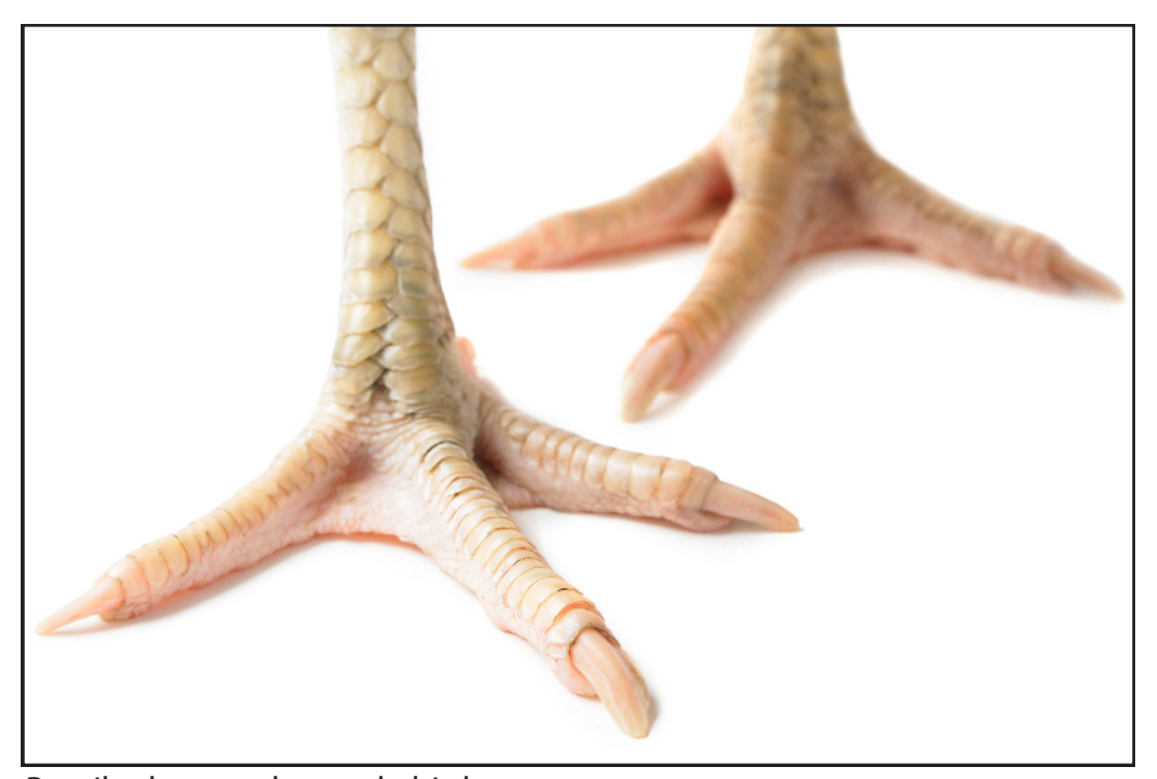
Reptiles have scales, so do birds.