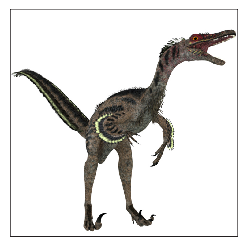
Artist's impression of a feathered velociraptor.