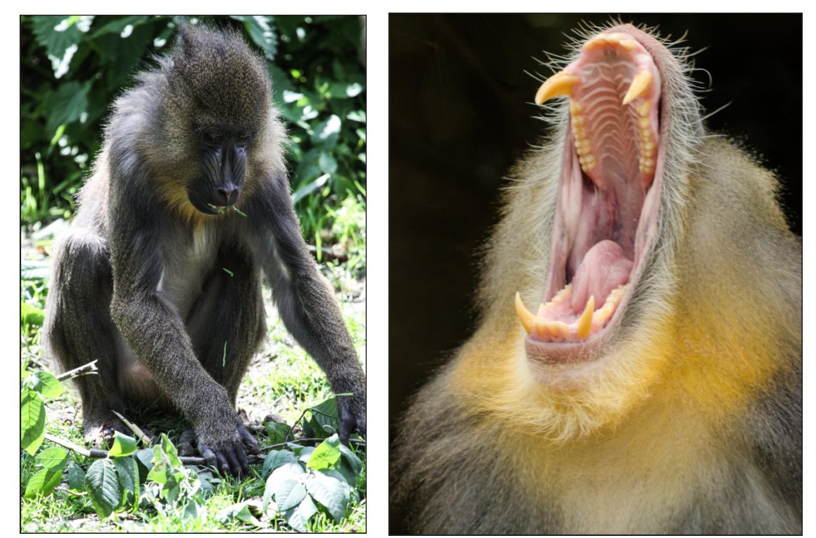
Mandrills eat plants as well as insects, small reptiles and amphibians.

You can usually tell the difference between omnivorous and carnivorous animals by comparing their teeth. The molars of carnivorous animals have sharp ridges that aid in cutting. The molars of omnivorous animals are flatter to aid the grinding process.